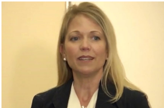
3209 x 1805 horiz