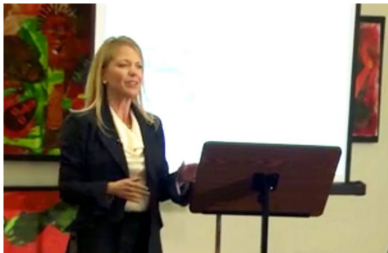
1024 x 684 horiz