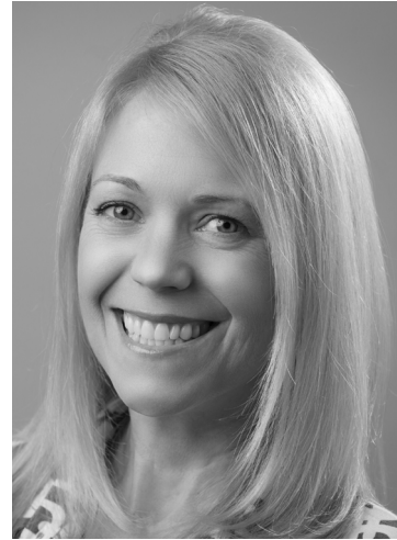
1450 x 1990 vert bw