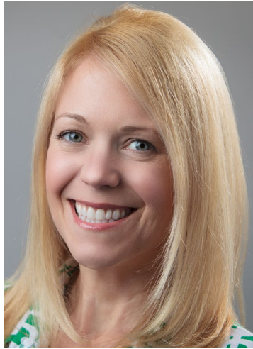
1049 x 1440 vert